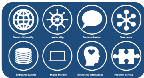
The 21st Century Skills

In 2023 students in Year 3 - 6 are required to bring an iPad to school that meets the specifications outlined below.