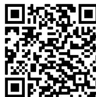
Microsoft One Drive