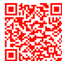
Pic Collage Edu $1.99