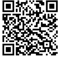
Microsoft Minecraft EDU