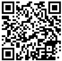
EP Student Education Perfect