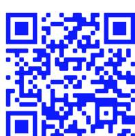
Scratch Jr (Year 3 Only)